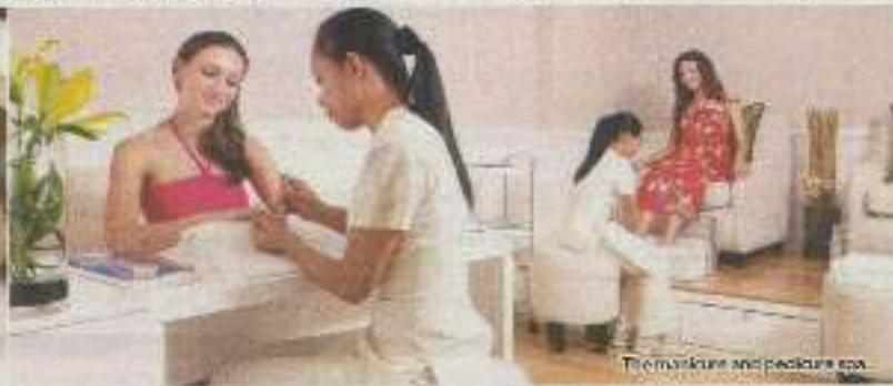
The manicure and pedicure spa