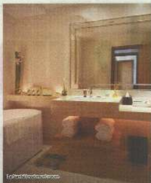
La Suite treatment room

It uses a non-invasive, state-of-the-art technology to produce new