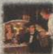
Laslette Fine Dining